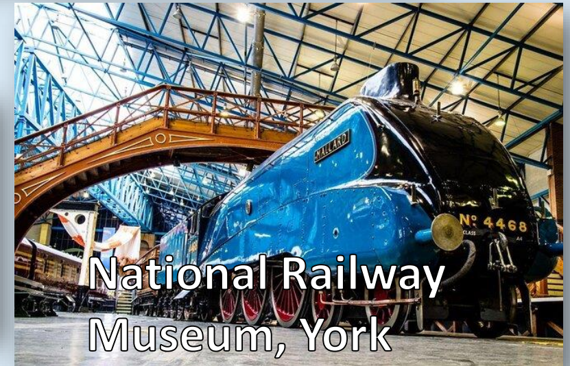
National Railway Museum, York