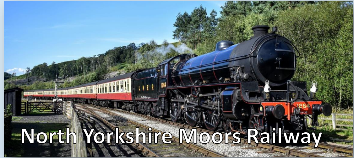
North Yorkshire Moors Railway