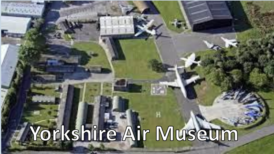
Yorkshire Air Museum