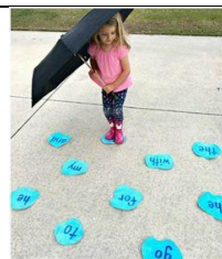
Sight Word puddle jumping

Learn the new tricky word - like and then watch the Phase 3 and 4 Tricky Words songs (see the YouTube weblinks above). Play noughts and crosses or puddle jumping with any of the following tricky words: